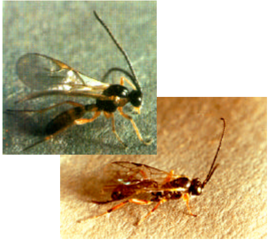
Hymenoptera parasite adults

These parasites are important in suppressing populations of many insects. The alfalfa weevil parasite, Bathyplectes curculionis may parasitize 80 to 90% of weevil larvae in the spring. At least four species of Aphidius and Praon have been released in the northwest and are important parasites of aphids, especially pea aphid. Aphelinus mali is a wellestablished parasite of woolly apple aphid. Nine parasites of omnivorous leaftier have been introduced, but only Bracon stabilis is abundant. Macrocentrus spp. are established and help suppress populations of oriental fruit moth and some tortricid larvae. Apanteles spp., Meteorus spp., and Campoletis spp are parasitic on several species of